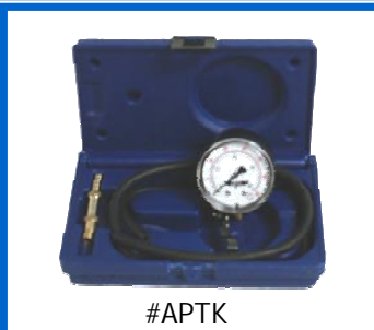
Used to set appliance pressure Includes: 35" water column gauge, hose, adapter & case